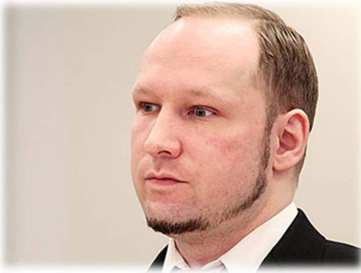
Fig 2. Anders Behring Breivik