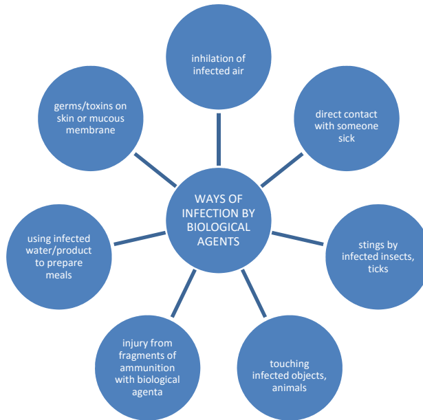
Fig. 2. Ways of infection by biological agents