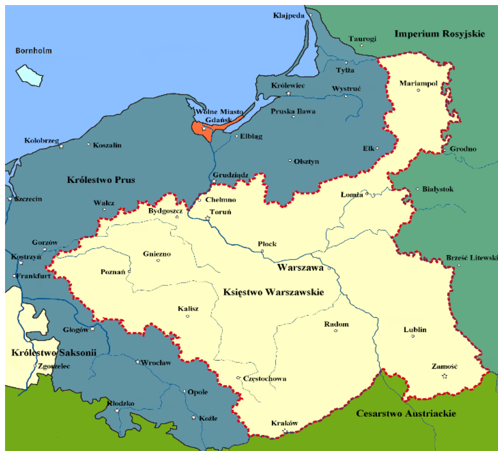
Map 2. The Duches of Warsaw 1807-1815

Source: Księstwo Warszawskie w latach 1807-1809 , Wikipedia https://pl.wikipedia.org/wiki/Ksi%C4%99stwo_Warszawskie