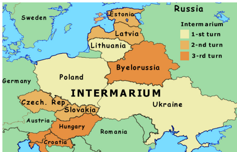
Map 5. Intermarium concept