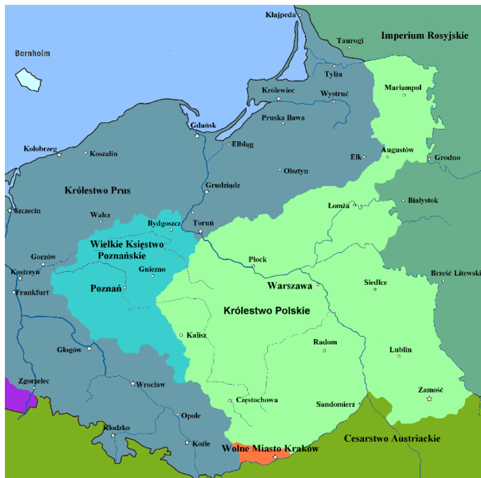
Map 3. The Polish Kindom 1815-1832

Source: Położenie Królestwa Polskiego, Wikipedia, https://pl.wikipedia.org/wiki/Kr%C3%B3lestwo_Polskie_(kongresowe)#/media/File:Congress_Poland_in_1815.PNG