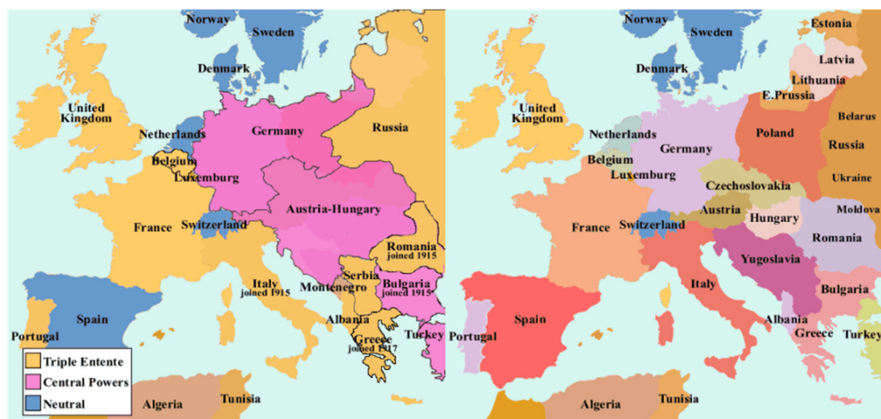
Map 6. Europe before and after World War I

Source: http://mrknighths.weebly.com/uploads/1/7/5/1/17517537/1362054795.png