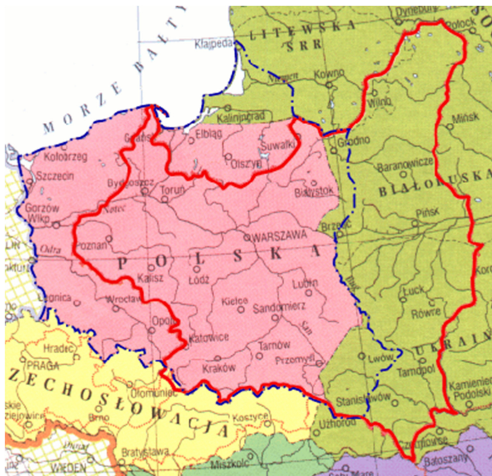
Map 4. II Republic of Poland in comparison to contemporary frontiers